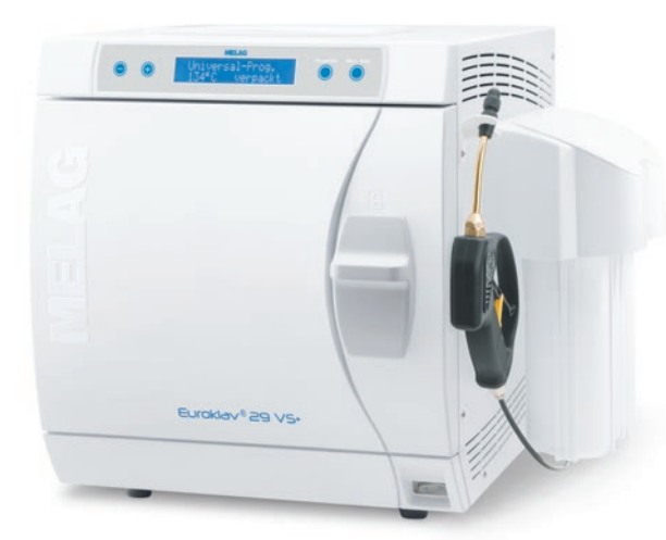
MELAdem®40 und MELAjet® mounted on the Euroklav® 29 VS+

Operating the autoclaves should be both pleasurable and safe. The design fully supports this demand. It shows what's essential, and does its work efficiently. The large door lock is not only a design feature, but also ensures a safe and easy opening and closing of the door.