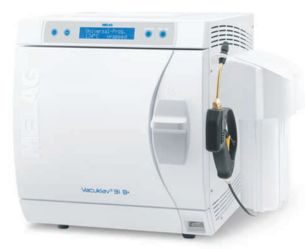
MELAdem®40 mounted on the Vacuklav® 31 B+

Operating the autoclaves should be both pleasurable and safe. The design fully supports this demand. It shows what's essential, and does its work efficiently. The large door lock is not only a design feature, but also ensures a safe and easy opening and closing of the door.