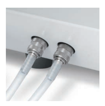
quick release connector

The large integrated funnel-shaped opening of the water storage tank makes it easy to fill the tank with demineralized or distilled water in the Vacuklav® 31 B+ and Vacuklav® 23 B+. Alternatively, both autoclaves could be fed the required water supply from any external reserve container or even be connected to a water treatment unit.