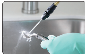
Fig. left: MELAJet® with individual attachments